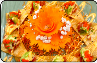
Spicy Tuna Nacho