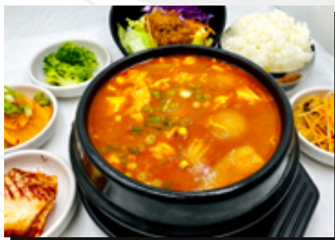
Seafood Hot Tofu Soup