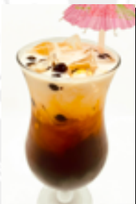
Thai Tea Boba