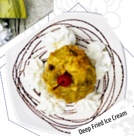
Deep Fried Ice Cream