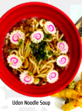
Udon Noodle Soup