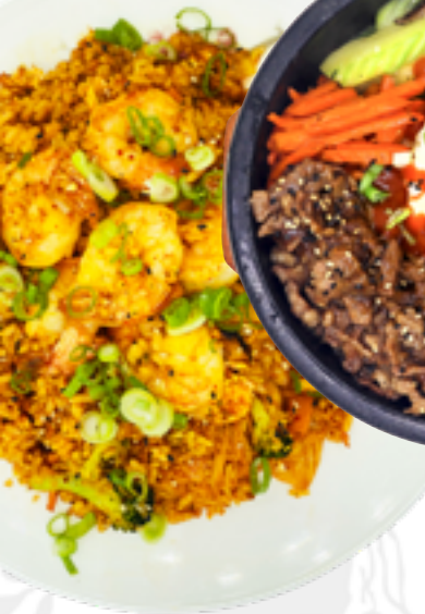
Shrimp Kimchi Fried Rice