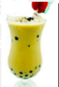
Lavender Milk Tea Boba