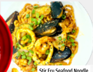
Stir Fry Seafood Noodle